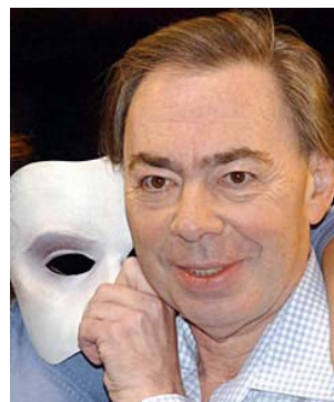
Composer: Andrew Lloyd Weber

This is a song from the musical Jesus Christ SuperStar. The story retraces the last 7 days of the life of Jesus. While Jesus sleeps, Mary Magdalene contemplates her relationship with this man. She has never experienced love in her life before and she realizes that her entire world has been turned upside down by Jesus.